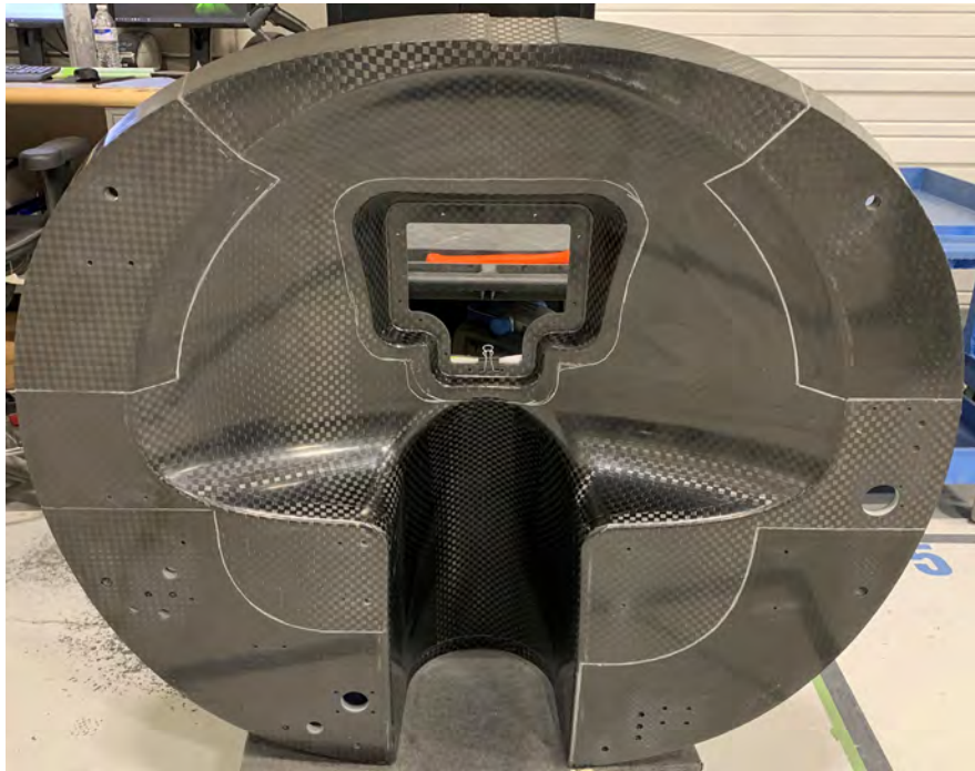
The primary carbon-fiber construction material makes up all major structures, all flight controls, trim tabs, cabin panels and flooring, most fairings and trim pieces, and even the firewall (shown here).

beef-ups required to meet certification standards for redundancy and crashworthiness (which allowed the E1000 to achieve certification in the tougher Utility Category). But, much of that weight is in interior improvements added because Epic wanted to, not because they had to.