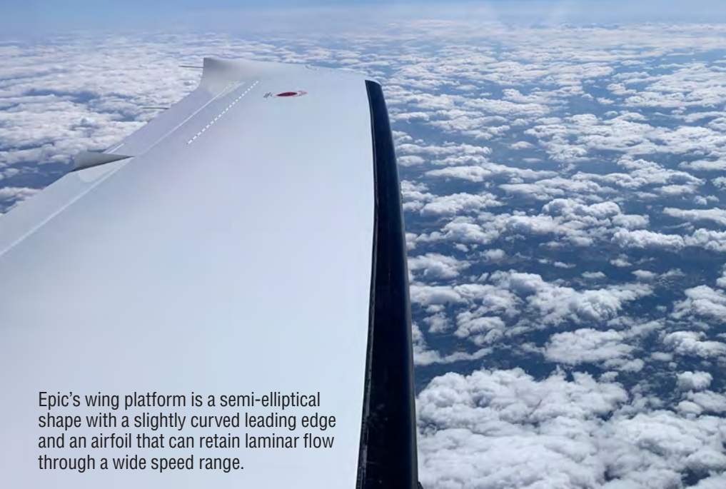
Epic's wing platform is a semi-elliptical shape with a slightly curved leading edge and an airfoil that can retain laminar flow through a wide speed range.

has). Once we settled into the flight deck, it was immediately obvious that actual pilots had significant input into the layout. All normal workflows are logical: left to right for startup and taxi, right to left for after-landing and shutdown. None of the nonsensical patterns I've experienced in so many aircraft types over the years.