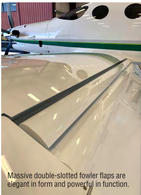
Massive double-slotted fowler flaps are elegant in form and powerful in function.

matter of funding that dooms them. Other times it's an inability to match early performance or price claims that causes their eventual demise. Usually, it's a combination of both.